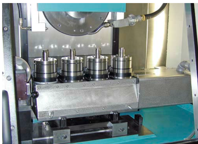
Processing chamber with clamping device

* Maximum grinding wheel diameter and travel can change due to work piece and fixture size